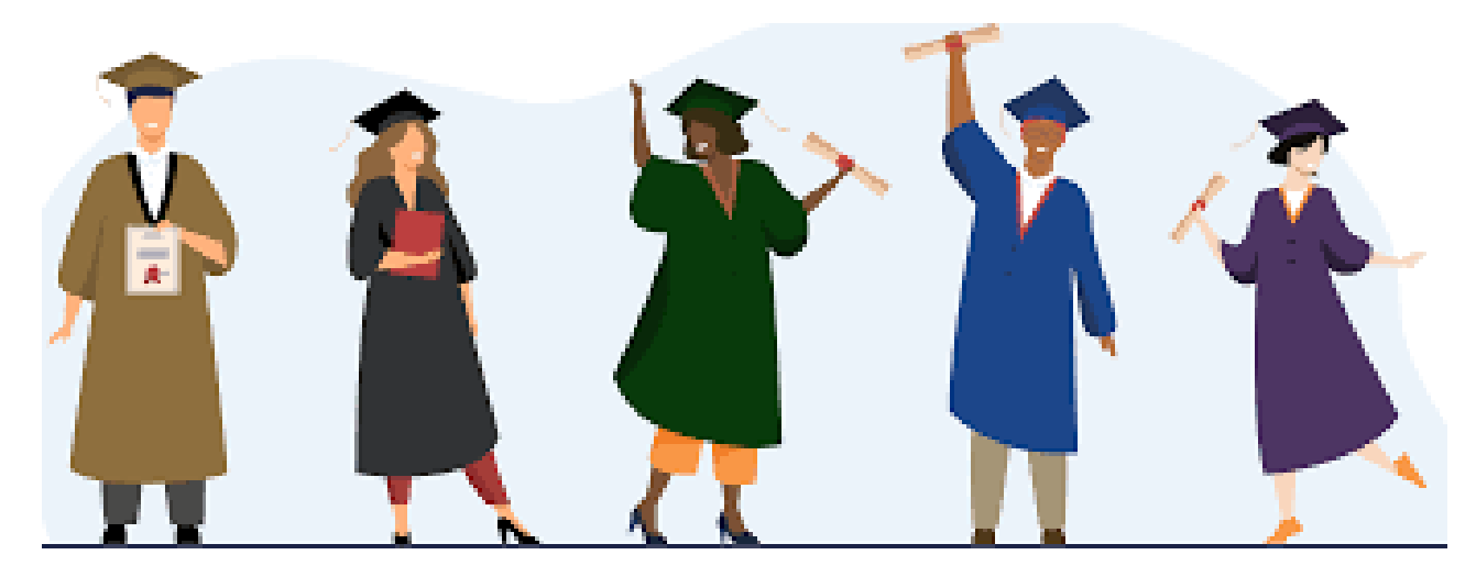
AHEPA Camden Chapter 69 & The Hellenic University Club of Philadelphia Virtual College/Career Panel Networking Event

A great opportunity for students to learn more about specific college majors and careers, available scholarship opportunities while networking with local professionals